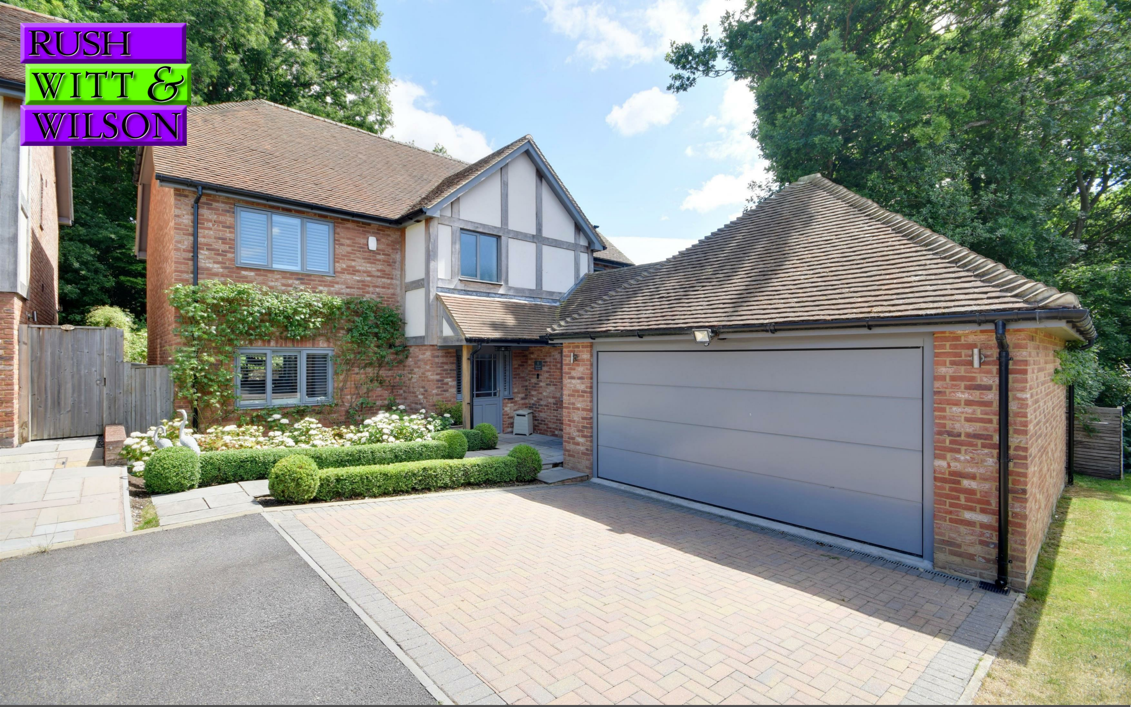
Juniper House, 6 Cedar Close, Northiam, East Sussex, TN31 6PL. £825,000 Guide Price.